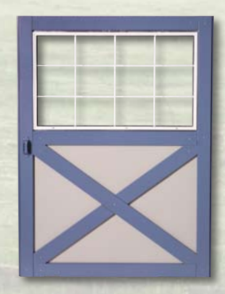
Arcadian Half Lite Slider