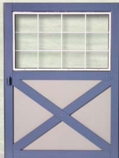
Arcadian Half Lite Slider